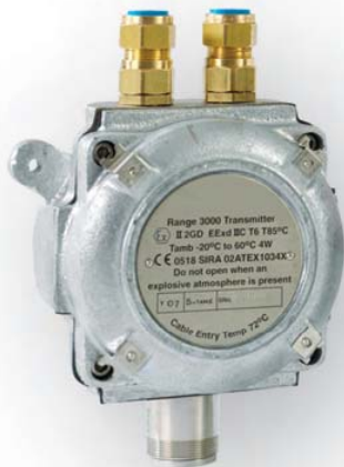
MM1000 Gas Detector